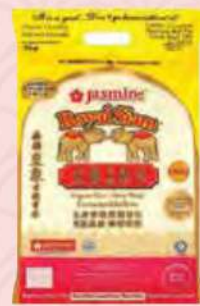
JASMINE ROYAL SIAM FRAGRANCE RICE 5KG RM41.28