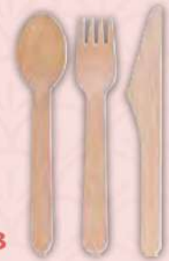
ECO WOODEN CUTLERY SET 60S/ SPOON 40S/ FORK 40S RM10.58 - RM15.68

AVAILABLE AT BANGSAR VILLAGE, SUNWAY GIZA, 1 MONT KIARA, CITTA MALL, DESA PARK ARKADIA, PARADIGM MALL JB, MID VALLEY SOUTHKEY & SUBANG PARADE ONLY.