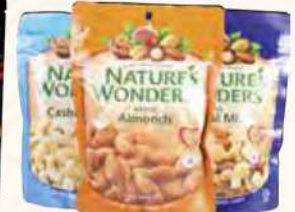
NATURE'S WONDER NUTS ASSORTED 130G-150G RM16.48