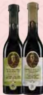
LUSETTI FLORINDO ORGANIC VINEGAR ASSORTED 250ML RM43.88