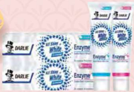
DARLIE ALL SHINY WHITE ENZYME TOOTHPASTE FLORAL FRESH/FRESH MINT 120G RM17.00