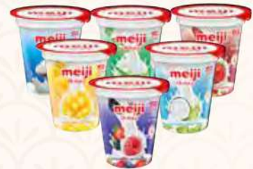
MEIJI LOW FAT YOGHURT ASSORTED 135G RM3.18