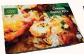
CHEESE BAKED RICE 510G RM15.88