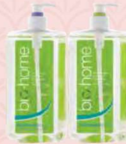
BIO-HOME DISHWASHING LIQUID ASSORTED 900ML RM11.88 RM12.90