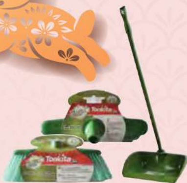
TONKITA ECO BROOM BRUSH/ DUSTPAN/ TOILET BRUSH RM21.98 - RM29.38 RM22.60 - RM30.90