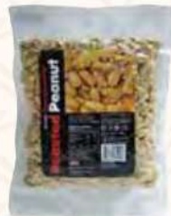
KISNUT KACANG SHANDONG 400G RM13.38