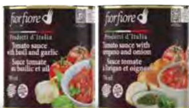
FIOR FIORE DICED TOMATOES ASSORTED 796ML RM9.88