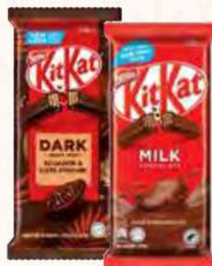
KITKAT CHOCOLATE BLOCK ASSORTED 170G RM9.48