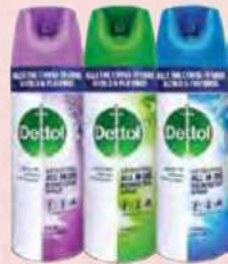
DETTOL DISINFECTANT SPRAY ASSORTED 450ML RM18.88 RM26.00