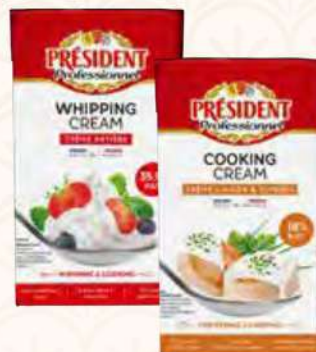
PRESIDENT UHT WHIPPING/ HALF CREAM 18% 1L RM28.88 - RM33.78