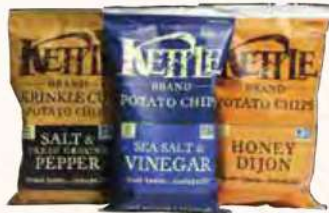
KETTLE CHIPS ASSORTED 142G RM13.88