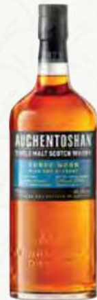
AUCHENTOSHAN THREE WOOD SINGLE MALT RM375.90