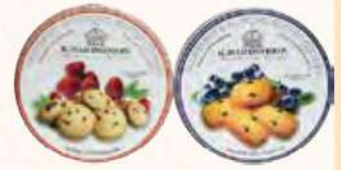
K HARROLDSON BUTTER COOKIES ASSORTED 360G RM24.38