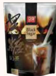
AH HUAT BLACK SUGAR MILK TEA 12S RM17.58

*Redeem at customer service counter, while stocks last.