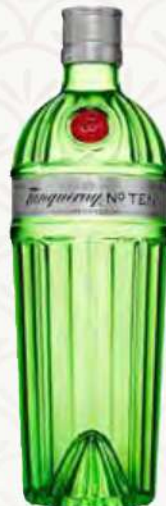
TANQUERAY NO. 10 RM299.90