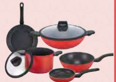
SHOGUN MURANO KITCHENWARES ASSORTED RM29.89 - RM198.99