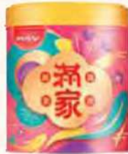
MUNCHY'S CNY ASSORTED BISCUITS LIMITED EDITION 319G RM10.28