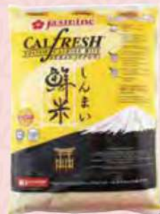
CALROSE CALFRESH 5KG RM30.68