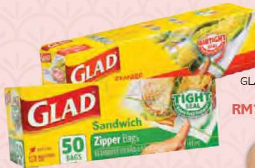
GLAD FOOD STORAGE BAG ASSORTED RM7.28 - RM11.78