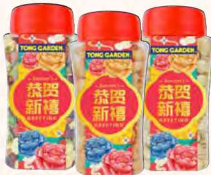
TONG GARDEN NUTS CANISTER ASSORTED 330G - 410G RM30.88