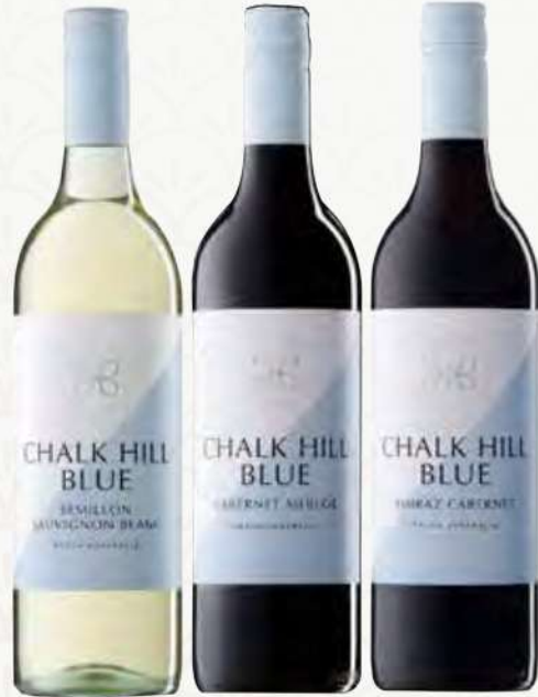
ANGOVE CHALK HILL BLUE CARBENET MERLOT SHIRAZ CARBENET/ SEMILION SAUVIGNON BLANC Buy any 3 bottles at RM188.90 RM70.00/Bottle