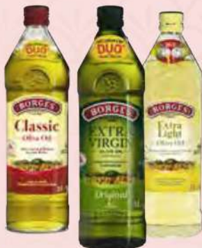
BORGES OLIVE OIL ASSORTED 1L RM42.88