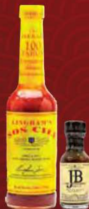
RM 5.08 - RM 6.48 each Lingham's Sos Cili 340g FREE JB Worcestershire Sauce 20g (On Pack)