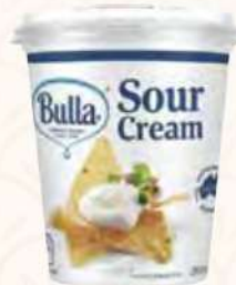
BULLA PREMIUM SOUR CREAM 200ML RM13.98