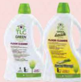
TLC GREEN FLOOR CLEANER ASSORTED 2L RM16.28 RM16.80