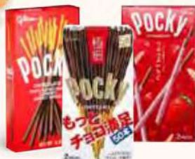
GLICO POCKY ASSORTED 70G - 71G/2 BAG RM8.18