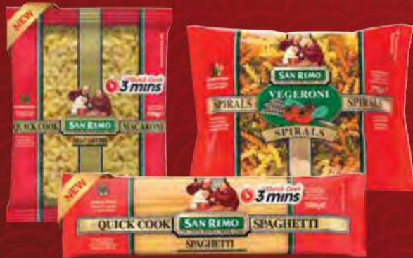
RM 5.08 each San Remo Dry Pasta 375g/500g (Assorted)