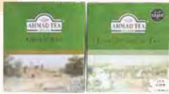
AHMAD TEA EARL GREY/ GREEN TEA/ ASMINE GREEN TEA/ ENGLISH BREAKFAST TEA 100S RM19.78 - RM20.38