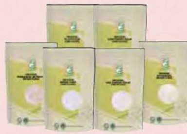
RADIANT ORGANIC FLOUR ASSORTED 1KG RM12.88