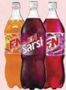
F&N BEVERAGE ASSORTED 1.5L RM3.68