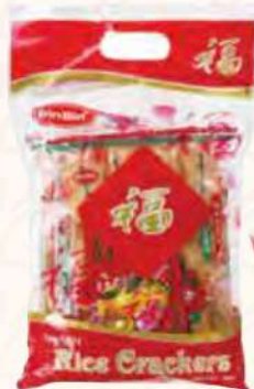
BIN BIN RICE CRACKER 2 X 150G RM16.98