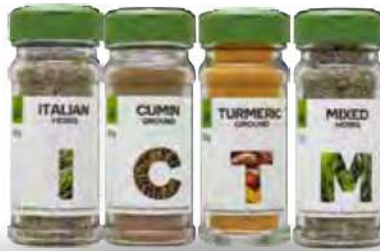
WOOLWORTHS HERBS & SPICES ASSORTED 2G - 60G RM4.58 - RM9.58