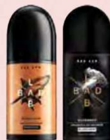
BAD LAB DEODORANT ROLL ON 50ML ASSORTED RM13.90