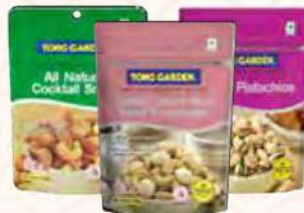
TONG GARDEN ASSORTED NUTS 140G-160G RM15.18-RM15.88