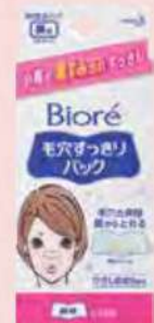
BIORE PORE PACK ASSORTED 10S RM14.00