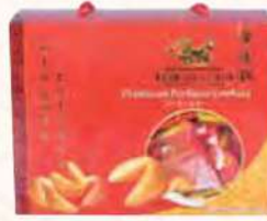
FAMOUS GOLD FORTUNE COOKIES 90G RM18.88