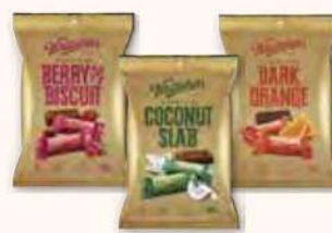
WHITTAKER'S SHARE BAGS ASSORTED 180G RM26.08