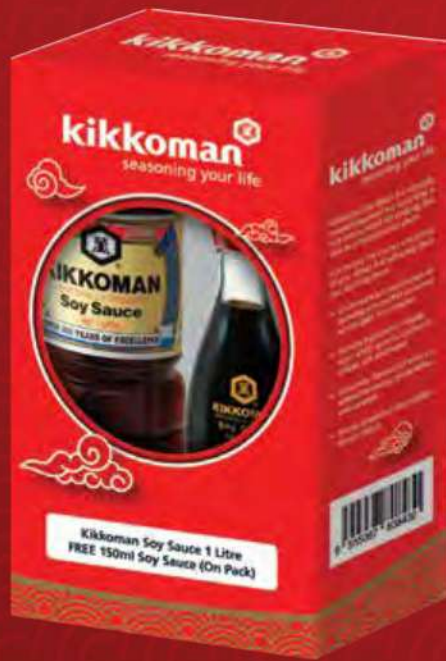
RM 19.28 each Kikkoman Soy Sauce 1L FREE Soy Sauce 150ml (On Pack)