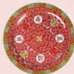
LITTLE HOMES PROSPERIT YEE SANG PLATE 16S RM14.88