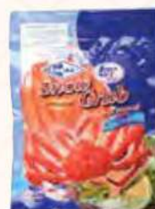
KANIKA SNOW CRAB LEG 200G RM10.38