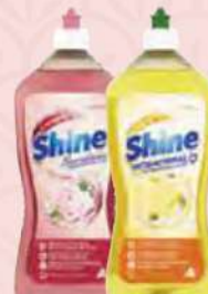
WOOLWORTHS SHINE DISHWASHING DETERGENT ASSORTED 900ML RM14.58 RM15.40