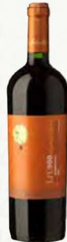
LFE 900 MALBEC RM179.90