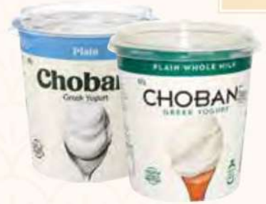
CHOBANI WHOLE MILK/ YOGHURT PLAIN 0% FAT 907G RM37.38