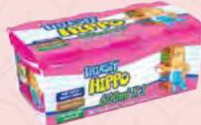
THIRSTY HIPPO 3 X 600ML RM19.88 RM20.95