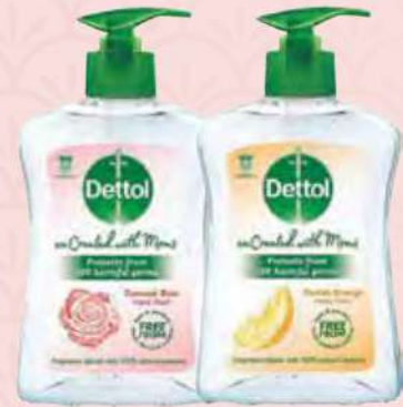
DETTOL HANDWASH ROSE/ CITRUS 250ML RM8.90