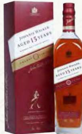
JOHNNIE WALKER 15 YEARS SHERRY FINISH RM299.90