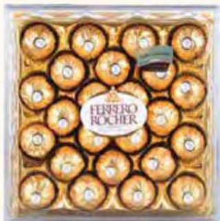
FERRERO ROCHER T24 300G RM39.88