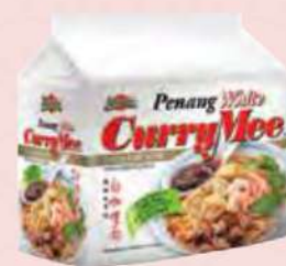
IBUMIE PENANG WHITE CURRY MEE 4 X 105G RM7.98