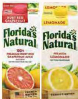
FLORIDA'S NATURAL JUICE ASSORTED 1.5L RM27.18 - RM30.08