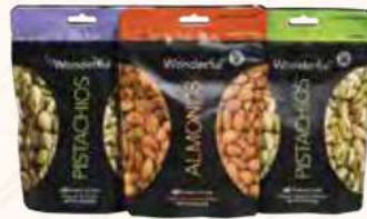
WONDERFUL PISTACHIOS/ ALMOND ASSORTED 168G RM22.88