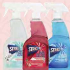
WOOLWORTHS PRO SPRAY ASSORTED 750ML RM10.98 - RM11.98 RM11.90 - RM12.90