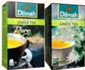
DILMAH GREEN TEA JASMINE PETALS/ PURE GREEN/MOROCCAN MINT/ SENCHA 20S RM9.38