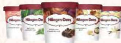
HAAGEN DAZS ICE CREAM ASSORTED 100ML RM9.18