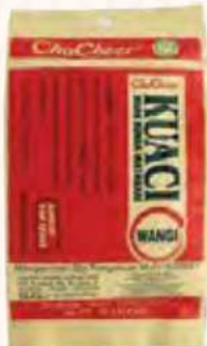
CHACHEER SUNFLOWER SEEDS ASSORTED 220G RM5.78 - RM7.18