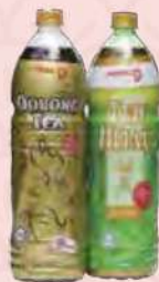
POKKA DRINKS ASSORTED 1.5L RM4.98 – RM5.98