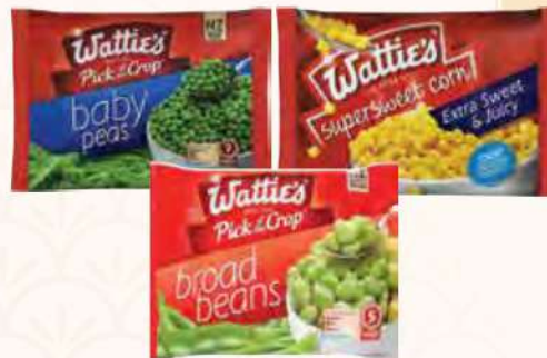
WATTIES BROAD BEANS/BABY BEANS/ CORN KERNEL 500G – 750G RM9.58 – RM14.98