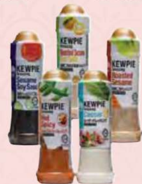
KEWPIE DRESSING ASSORTED 210ML RM7.48 - RM8.88