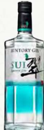
SUNTORY SUI GIN RM219.90