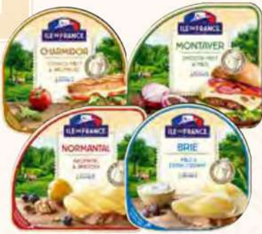
I DE FRANCE SLICED CHEESE ASSORTED 125G RM17.28