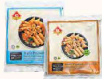
K.G. PASTRY SPRING ROLL 190MM X 190MM 50S/ 215MM X 215MM 50G RM6.58