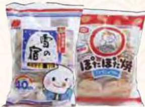
KAMEDA POTA POTA YAKI 58G/ SANKO YIKI NO YADO RICE CRACKERS 175G RM10.88