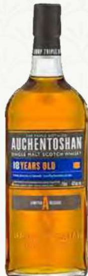
AUCHENTOSHAN 18 YEARS OLD RM558.90