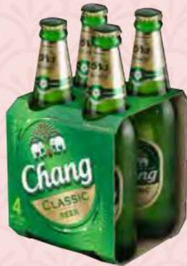
CHANG CLASSIC BEER 4 X 320ML RM48.88