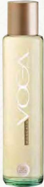
VOGA MOSCATO RM79.90