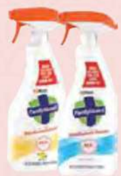
FAMILYGUARD MULTI SURFACE DISINFECTANT CLEANER ASSORTED 500ML RM13.48 RM14.10