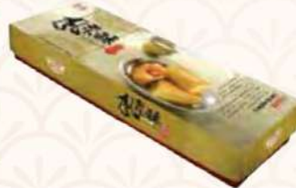
ROYAL FAMILY ROYAL PINEAPPLE CAKE 300G RM39.88