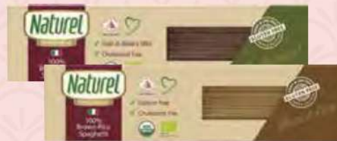
NATUREL ORGANIC 100% BUCKWHEAT/ BROWN RICE SPAGHETTI/ FUSILLI 250G RM12.88