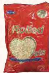
PRISTINE ROLLED OATS 750GM RM9.18