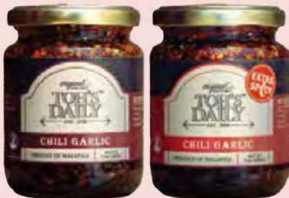
TOH'S DAILY CHILI GARLIC - EXTRA SPICY/ORIGINAL 200G RM21.88