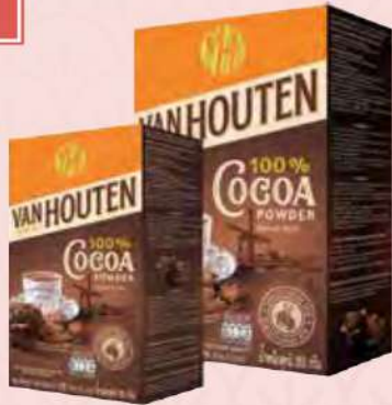
VAN HOUTEN COCOA POWDER BOX 100G/350G RM8.08 - RM24.08