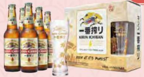
KIRIN ICHIBAN BEER JAPAN'S PRIME BREW PINT 6X330ML + 1 FOC SEASONAL GLASS RM78.88