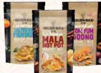
GOLDEN DUCK ASSORTED SNACKS 101G - 108G RM23.88