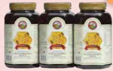
CF ACACIA HONEY 3 X 1KG RM136.88