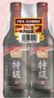
KNIFE CLASSIC LIGHT LOY SAUCE TP 2 X 500ML RM11.88