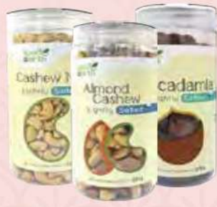
LOVE EARTH LIGHTLY SALTED ALMOND/ PISTACHIO/ MACADEMIA 260G - 350G RM38.88