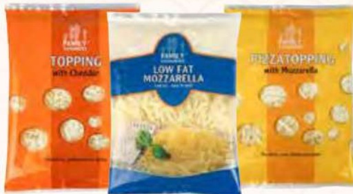
FAMILY SHREDDED/GRATED CHEESE ASSORTED 150G RM9.48