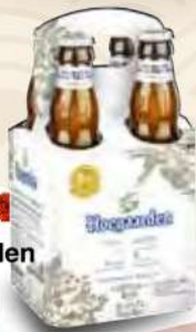
Hoegaarden White 4x330ml RM59.88 /pack