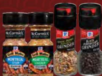
RM 5.49 - 30.28 each McCormick Herbs & Spices 2g-90g (Assorted)