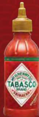
RM 12.38 each Tabasco Sriracha Sauce 256ml