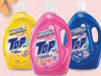
TOP LIQUID DETERGENT ASSORTED 3.6KG - 3.8KG RM20.88 RM27.50