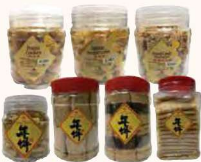
COOKIE KITCHEN COOKIES/ SNACKS ASSORTED 270G - 400G RM20.08 - RM27.98