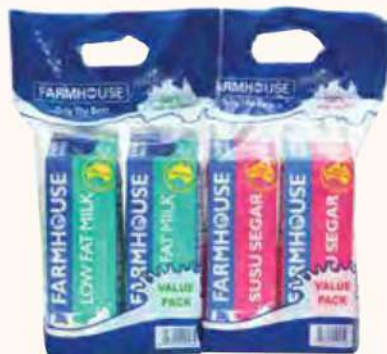
FARMHOUSE FRESH MILK HICAL LOW FAT 2 X 1L RM22.28