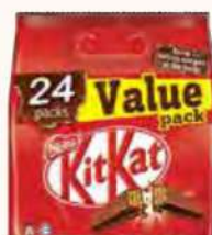
KIT KAT SHARE BAG 24 X 17G RM19.98