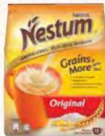
NESTLE NESTUM 3IN1 CEREAL ASSORTED 270G - 450G 12.48 - 13.18