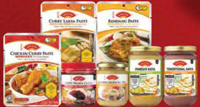
RM 5.38 - 8.98 each Dollee All Range (Assorted)