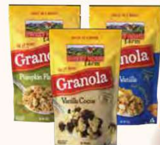
SWEET HOME FARM GRANOLA ASSORTED 454G RM33.88