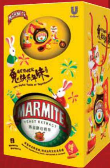
RM 38.88 each Marmite Yeast Extract 470g FREE Bowl (On Pack)