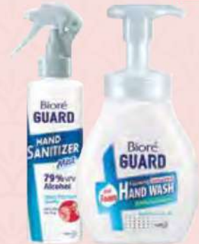
BIORE GUARD SANITIZER SPRAY 150ML/ ANTI-BAC HANDWASH 250ML RM24.90