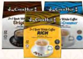
CHEKHUP 3IN1/2IN1 ASSORTED 12S X 30G-40G RM18.68 - RM19.98