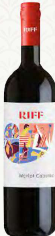
ALOIS LAGEDER RIFF ROSSO MERLOT CABERNET RM73.90