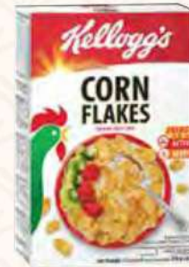
KELLOGG'S CORNFLAKES 275G RM7.48