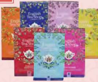
ENGLISH TEA SHOP ORGANIC TEA ASSORTED 20S RM18.88