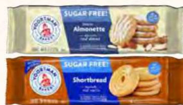
VOORTMAN SUGAR FREE COOKIES ASSORTED 227G RM12.88