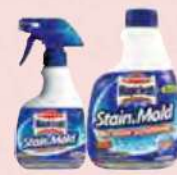
MAGICLEAN STAIN & MOLD REMOVER REFILL/ TRIGGER 400ML RM8.88 - RM11.18 RM9.75 - RM12.20