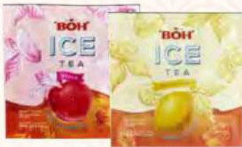
BOH ICE TEA PEACH 20'S X 14.5GM RM12.38