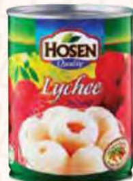
HOSEN LYCHEE 565G RM7.98