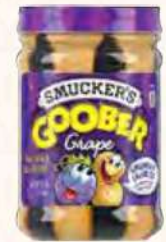
SMUCKER'S GOOBER GRAPE 180Z RM22.88