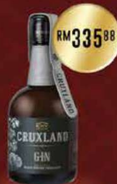
CRUXLAND KALAHARI TRUFFLES GIN