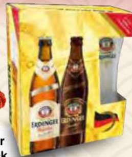
Erdinger Gift Pack (2 Weissbier + 2 Dunkel x500ml + FOC 1 Glass) RM87.88 /pack