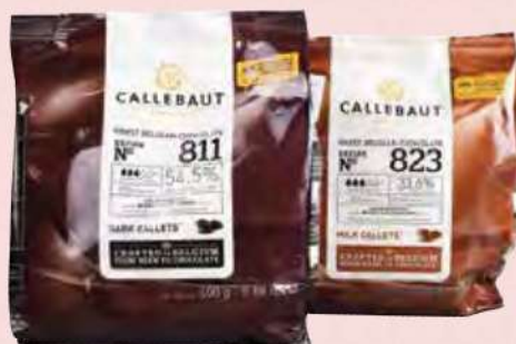
CALLEBAUT CHOCOLATE ASSORTED 400G RM27.08 - RM28.48