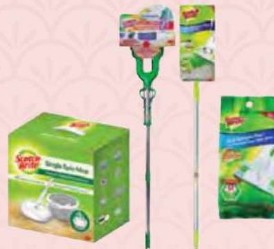
SCOTCH BRITE CLEANING KITS ASSORTED BUY 1 GET FREE REFILL PACK for Scotch Brite Wipes Orange RM31.48 - RM153.28 RM33.70 - RM164.30