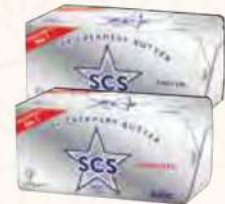
SCS SALTED/ UNSALTED BUTTER 225G - 250G RM15.18