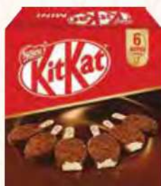
KIT KAT MINI STICK MULTIPACK (6X45ML) RM13.98