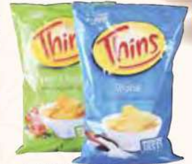
THINS POTATO CHIPS ASSORTED 175G RM12.88 - RM13.68