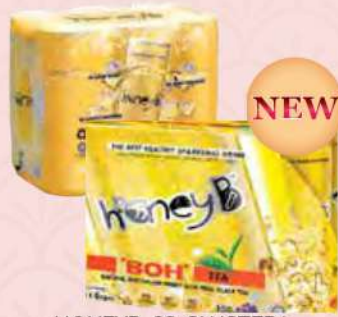
HONEYB 6S CLUSTER/ BLACK TEA 6 X 250ML RM19.38