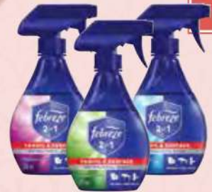
FEBREZE 2IN1 FABRIC & SURFACE ANTIBACTERIAL SPRAY ASSORTED 370ML RM13.58 RM14.90