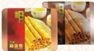
KAM HIONG YUEN BUTTER/ SESAME EGG ROLLS 290G RM27.68