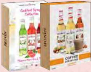
MONIN MOCKTAIL SET SYRUP 3 X 5CL RM41.18