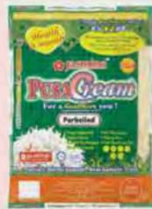
JASMINE PUSA CREAM BASMATHI SELLA PARBOILED 5KG RM41.68