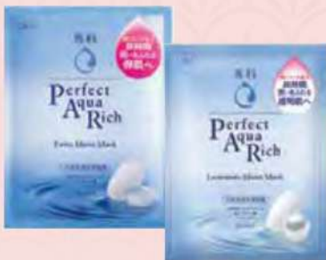
SENKA PERFECT AQUA FACIAL MASK ASSORTED 1S RM10.20 - RM12.10