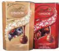
LINDT LINDOR CORNET ASSORTED 200G RM25.88