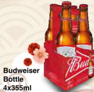
Budweiser Bottle 4x355ml RM58.48 /pack