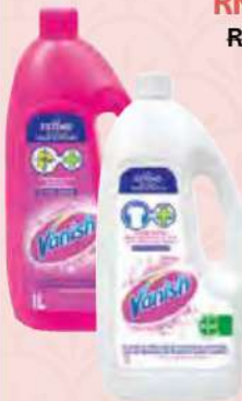
VANISH LIQUID ASSORTED 1L RM18.88 RM19.90