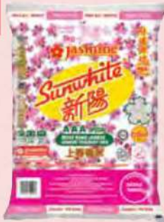
JASMINE SUNWHITE FRAGRANT RICE 5KG RM30.88