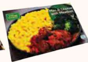
MAC & CHEESE WITH MEATBALL 530G RM14.88