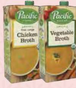
PACIFIC FOODS ORGANIC LOW SODIUM/ FREE RANGE CHICKEN BROTH 946ML RM20.88 - RM22.88