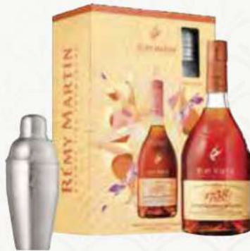
REMY MARTIN 1738 RM439.90