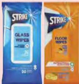
WOOLWORTHS STRIKE FLOOR WIPES 20PACK/ GLASS WIPES 50PACK RM8.98 - RM12.98 RM9.90 - RM13.90