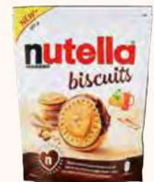
FERRERO NUTELLA BISCUITS 304G RM 29.88