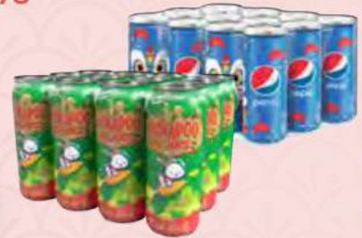
PEPSI/7UP/KICKAPOO ASSORTED 12 X 320ML RM16.88