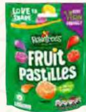
ROWNTREES FRUIT PASTILLE VEGAN POUCH 143G RM9.98