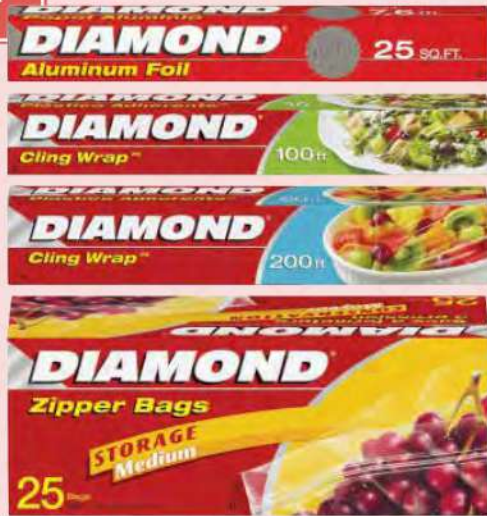
DIAMOND ALUMINIUM/ CLING WRAP/ COOKING & BAKING PAPER/ ZIPPER BAGS ASSORTED RM7.28 - RM21.48