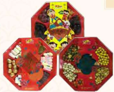
KISE HEXAGON NUTS & FRUITS ASSORTED 450G - 580G RM18.88 - RM28.88