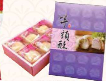
TYT TARO CAKE 6'S 300G RM46.98