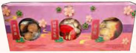
STYLE FOOD PREMIUM GIFT PACK 3IN1 (PINEAPPLE TART 350G, PEANUT COOKIES 280G, BANGKIT COOKIES 250G) RM39.88