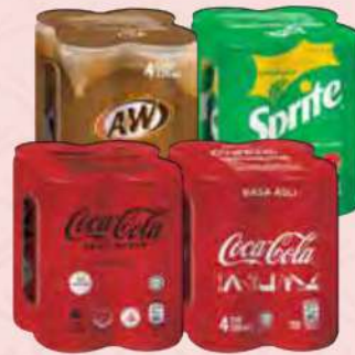
COCA COLA RASA ASLI/ ZERO SUGAR/SPRITE/A&W SARSAPARILLA CAN 4X320ML RM6.48 – RM6.78