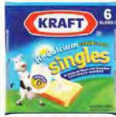
KRAFT HI-CALCIUM SINGLE 6S 125G RM6.48