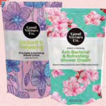
GOOD VIRTUES & CO SHOWER CREAM REFILL ASSORTED 550ML - 600ML RM11.90

*PROMOTION VALID FOR ITEM OF THE SAME RANGE ONLY.