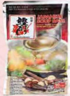
SANKO SANGYO KATSUO HURIDASHI 20P RM26.88