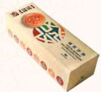
HUAT HUAT SALTED GREEN BEAN PASTRY 450G RM28.98