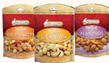
CAMEL NATURAL NUTS ASSORTED 130G - 150G RM15.88 - RM17.18