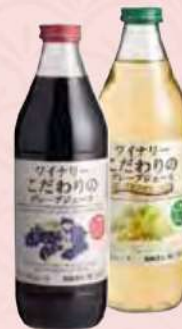
ALPS ELABORATE GRAPE JUICE/ PREMIUM WHITE 1L RM28.88