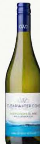
CLEARWATER COVE SAUVIGNON BLANC RM73.90