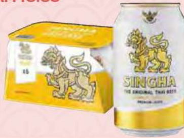
SINGHA BEER CAN 6X330ML RM62.88