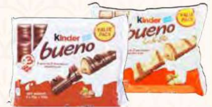
KINDER BUENO T6 ASSORTED FP 3 X 4.3G RM11.88