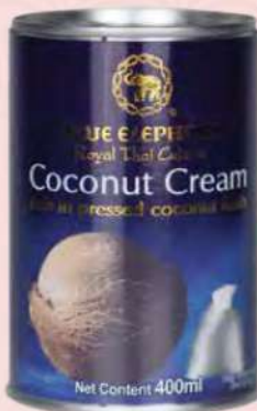
BLUE ELEPHANT COCONUT CREAM 400ML RM13.88