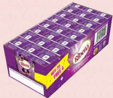
RIBENA RTD BLACKCURRANT 20+4 X 200ML RM30.88