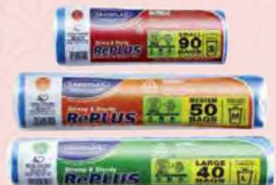
SEKOPLAS REPLUS GARBAGE BAG ROLL S90/ M50/ L40 RM11.98 - RM17.88 RM12.60 - RM18.40