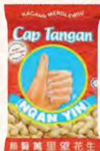
KACANG CAP TANGAN 120G RM4.48