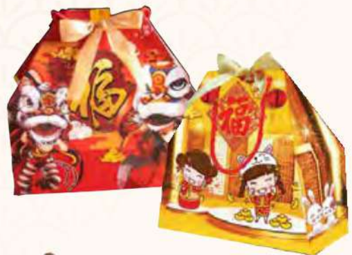
YCH REUNION HOT POT 410G/ HEALTHY LONGEVITY 490G RM48.88