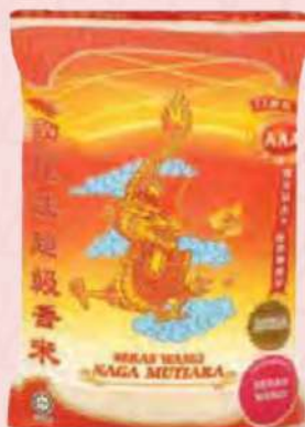
DRAGON FRAGRANT RICE 10KG RM50.88