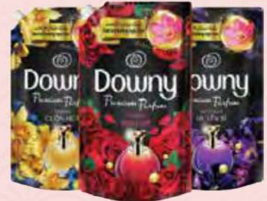
DOWNY FABRIC SOFTENER REFILL ASSORTED 1.35L - 1.5L RM17.48 RM20.50 - RM20.70