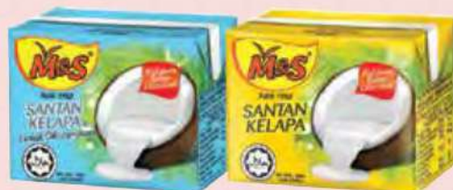
M&S COCONUT MILK REGULAR/ LOW FAT 200ML RM2.58 - RM2.80