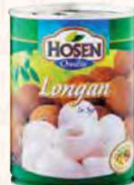
HOSEN LONGAN 565G RM9.58