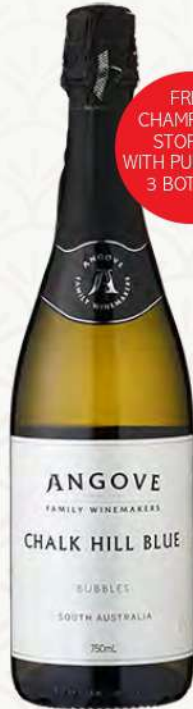
ANGOVE CHALK HILL BLUE BUBBLE RM119.90