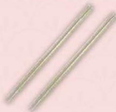
LITTLE HOMES WOODEN LONG CHOPSTICKS 2PCS RM2.98