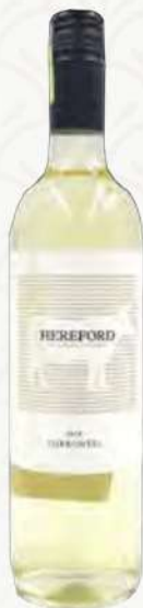
HEREFORD TORRONTES RM66.90