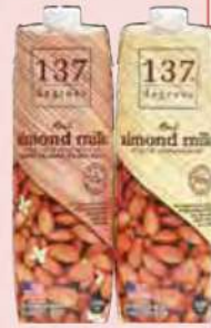
137 DEGREES ALMOND MILK ORIGINAL/UNSWEETENED 1L RM17.58