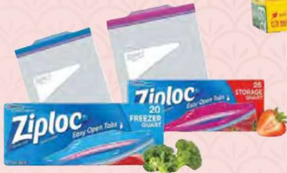
ZIPLOC FOOD STORAGE BAG ASSORTED RM9.78 - RM16.18