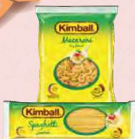
KIMBALL PASTA ASSORTED 400G RM3.18