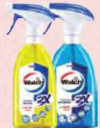
WALCH MULTI-PURPOSE CLEANER ASSORTED 500ML RM12.88 RM14.30