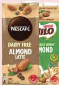
MILO PLANTBASED ACT-GO ALMOND/ NESCAFE DAIRY FREE ALMOND UHT 1L RM10.18