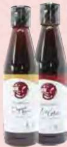
MU ARTISAN ORGANIC BEAN/ NON GLUTEN LIGHT SOY SAUCE 400ML RM17.88