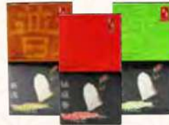
TLJ TEA ASSORTED 25S X 2G RM11.48 - RM13.58