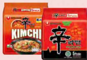
NONGSHIM RAMYUN 4 X 100G/5 X 112G-140G RM14.18 - RM23.58