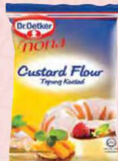
DR OETKER NONA FLOUR ASSORTED 300G - 900G RM3.68 - RM8.98