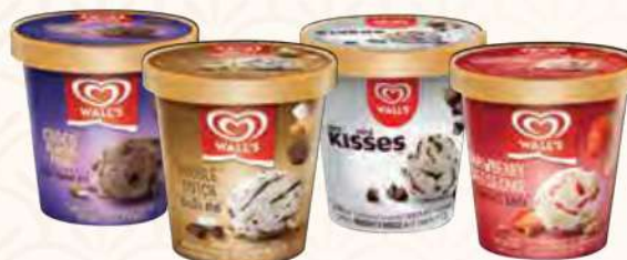
WALL'S SELECTION ICE CREAM ASSORTED 750ML RM11.98