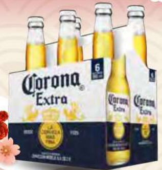
Corona Extra 6x355ml RM81.00 /pack