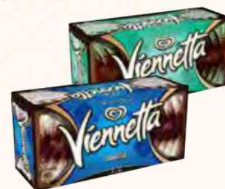
WALL'S VIENNETTA ICE CREAM ASSORTED 650ML RM26.88