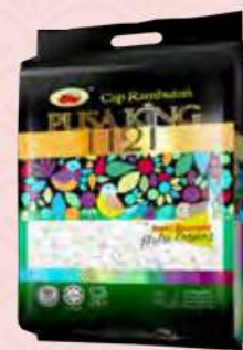
BASMATHI RAMBUTAN PUSA KING 1121 5KG RM45.78