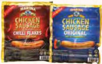
MARINA CHICKEN SAUSAGE ORIGINAL/ CHEESE/CHILLI FLAKES 300G RM6.28 – RM7.88