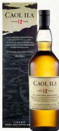
CAOL ILA 12 YEARS OLD RM326.90