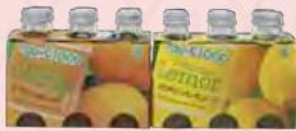
YOU C1000 LEMON/ ORANGE/APPLE DRINK 6 X 140ML RM16.38