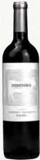
HEREFORD CABERNET SAUVIGNON MALBEC RM57.90