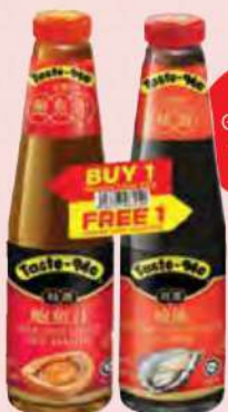
TASTE ME ABALONE SAUCE 510G RM11.38