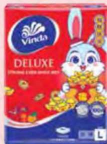
VINDA DELUXE TISSUE 3PLY (L) 4 X 110S RM9.88 RM12.90