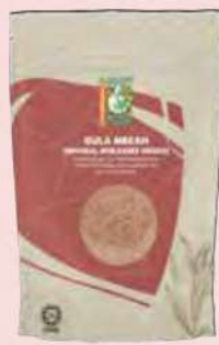
RADIANT MOLASSES SUGAR NATURAL 1KG RM11.88