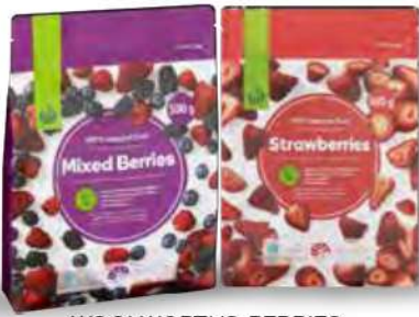
WOOLWORTHS BERRIES ASSORTED 500G RM25.88 - RM37.88