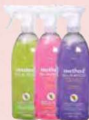
METHOD ALL-PURPOSE SURFACE CLEANER LIME & SALT/ FRENCH LAVENDER/ PINK GRAPEFRUIT/ CLEMENTINE 828ML RM20.88 RM23.60