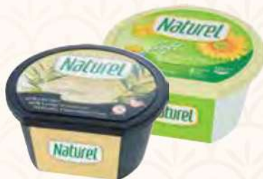
NATUREL MARGERINE ASSORTED 500G RM11.18 - RM11.98