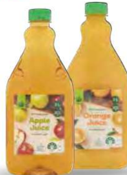
WOOLWORTHS JUICE ASSORTED 2L RM14.98