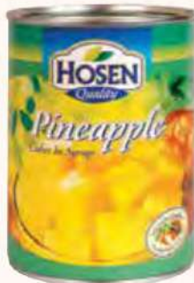
HOSEN PINEAPPLE SLICE/CUBES 565G RM6.28