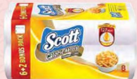
SCOTT CALORIE ABSORB PREMIUM TOWEL 8R RM16.48 RM17.40