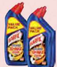
HARPIC TOILET BOWL CLEANER ASSORTED 2 X 450ML - 500ML RM12.88 RM14.50