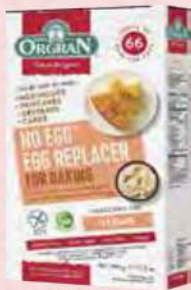
ORGRAN NO EGG EGG REPLACER 200G RM5.48