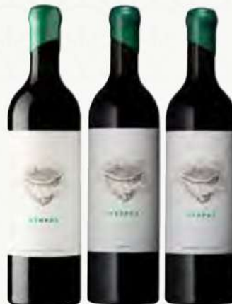
UTOPOS CABERNET SAUVIGNON/ MATARO SHIRAZ GRENACHE/SHIRAZ Mix & Match Buy Any 2 Bottles at RM359.90 RM200.00/Bottle