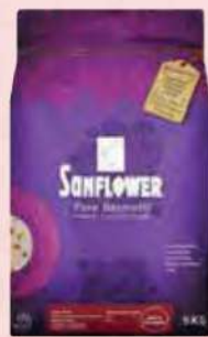
SUNFLOWER PURE BASMATHI RICE PUSA 5KG RM47.68