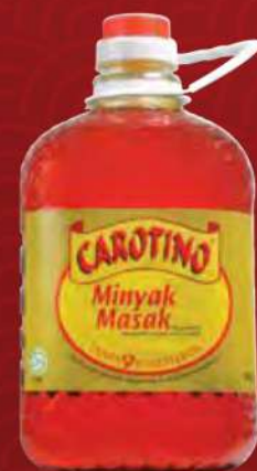
RM 34.18 - 35.18 each Carotino/Smart Balance Cooking Oil 3kg