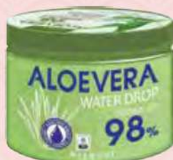
MISEOUL ALOE VERA WATER DROP ESSENCE GEL 98% 300G RM61.30