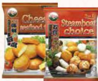
FIGO CHEESE SEAFOOD TOFU/STEAMBOAT CHOICE 5IN1 500G RM12.18 – RM13.38