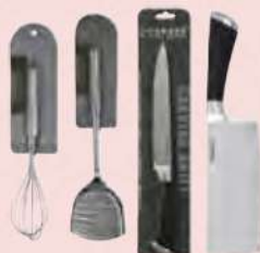
FUKURO STAINLESS STEEL/ CHEF SERIES KITCHENWARES ASSORTED RM5.18 - RM43.48 RM5.90 - RM49.90