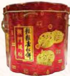
MACAU SPECIALITY ALMOND CAKE 400G RM29.88