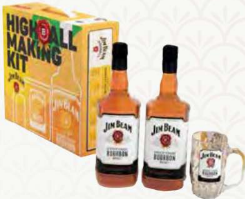
JIM BEAM WHITE LABEL VAP (TWICE BOTTLE) RM423.90