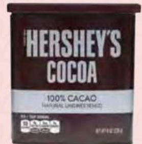
HERSHEY'S BAKING COCOA UNSWEETENED 226G/ SPECIAL DARK COCOA POWDER 80Z RM20.98