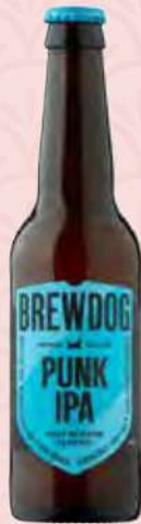
BREWDOG PUNK IPA 330ML RM19.88