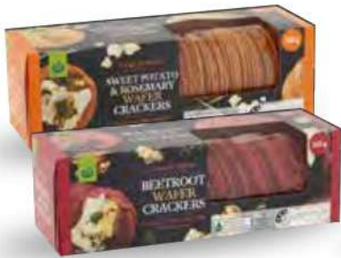
WOOLWORTHS WAFER CRACKERS ASSORTED 100G RM9.98