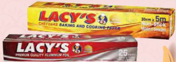
LACYS ALUMINIUM FOIL/ BAKING & COOKING PAPER CLING FILM/ ZIPBAG ASSORTED RM7.98 - RM11.78