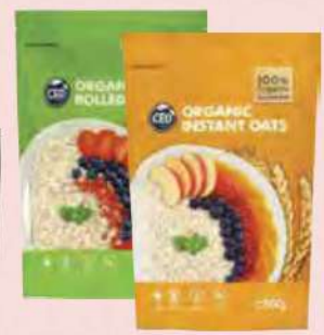
CED ORGANIC ROLLED OAT REGULAR/ INSTANT 500G RM8.88