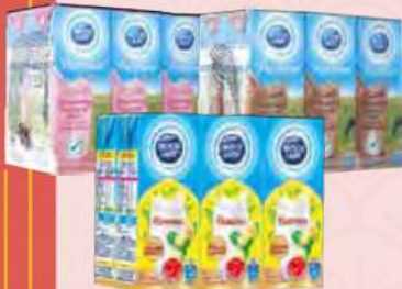
DUTCH LADY UHT MILK ASSORTED 6 X 200ML RM9.98