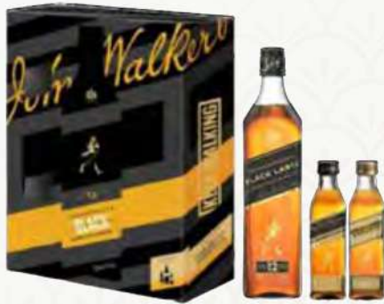
JOHNNIE WALKER BLACK LABEL F23 GIFT PACK VAP RM279.90