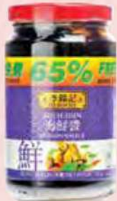
LKK HOISIN SAUCE (240G + 157G) RM7.98