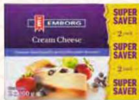
EMBORG CREAM CHEESE TWIN PACK 2 X 200G RM17.78