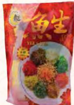
ST YEE SANG EASY PACKAGE 450G RM42.88