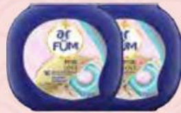
AR FUM LAUNDRY CAPSULES ASSORTED 42'S RM49.88 RM59.90