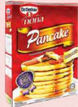
NONA PANCAKE FLOUR ASSORTED 400G RM9.38