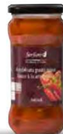
FIOR FIORE ARRABBIATA PASTA SAUCE 346ML RM8.88