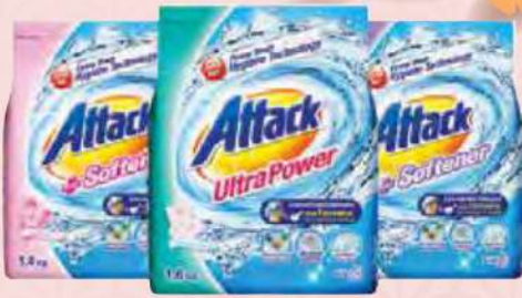
ATTACK POWDER DETERGENT ASSORTED 1.4KG - 1.6KG RM16.88 RM18.90