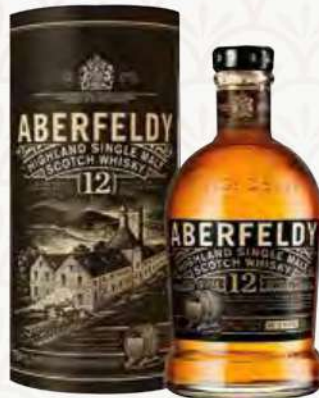
ABERFELDY SINGLE HIGHLAND MALT SCOTCH WHISKY 12 YEARS RM287.90