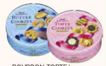
BOURBON TORTE/ BUTTER COOKIE (WITH CAN) 524G - 537G RM35.88