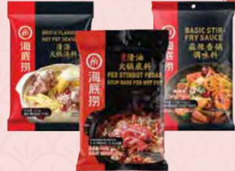
HAILILAO HOT POT ASSORTED 110G - 220G RM8.88