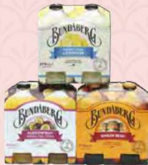
BUNDEBERG BOTTLE ASSORTED 4 X 375ML RM22.88 – RM25.88