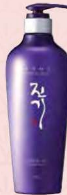
DAENG GI MEO RI VITALIZING SHAMPOO/ TREATMENT 500ML RM79.00