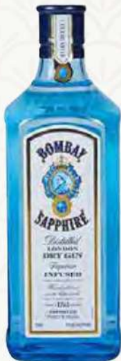
BOMBAY SAPPHIRE GIN RM232.90