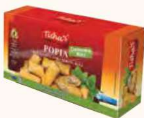
TISHAS POPIA CHEESE CARBONARA 300G RM13.88