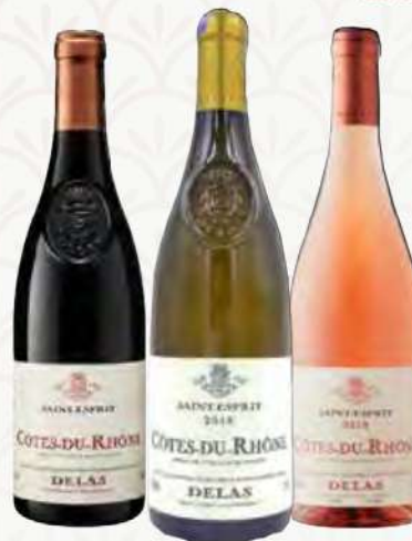
DELAS COTES DU RHONE BLANC SAINT ESPRIT/ROUGE SAINT ESPRIT/ ROSE SAINT ESPRIT

Buy any 2 Bottles at RM156.90 RM87/Bottle