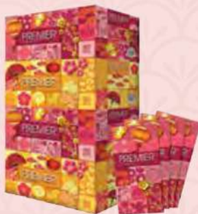
PREMIER FACIAL TISSUE - CNY BOX 4 X 200S RM14.28 RM15.25