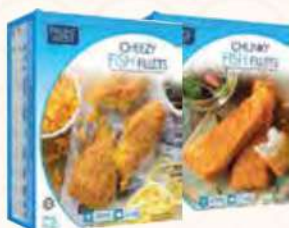
PACIFIC WEST CHUNKY FISH FILLET 360G/ TEMPURA CHEEZY FISH 290G RM19.58 – RM20.18