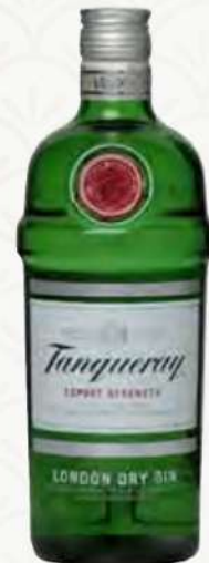
TANQUERAY LONDON DRY GIN RM232.90