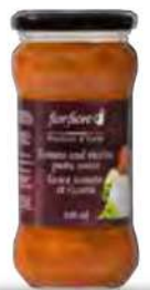
FIOR FIORE TOMATO AND RICOTTA PASTA SAUCE 338ML RM11.88