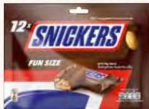
SNICKERS FUNSIZE ASSORTED 220G - 240G RM12.88