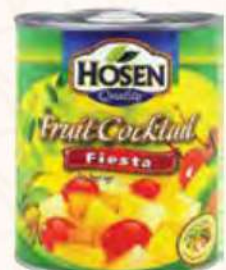
HOSEN FIESTA FRUIT COCKTAIL 836G RM8.48