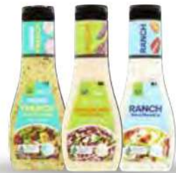
WOOLWORTHS DRESSING ASSORTED 290ML - 300ML RM9.58