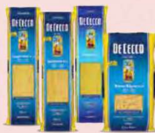
DE CECCO PASTA ASSORTED 500G RM10.18 - RM13.98