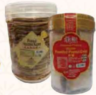
ORIENTED CRAVING PEANUT NYONYA KAPET/POUNDED PEANUT CRISP 300G - 400G RM26.18 - RM29.98