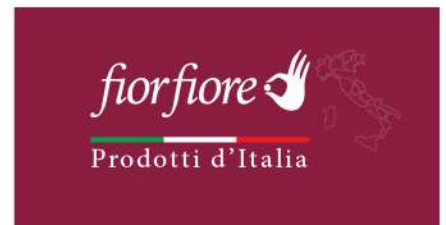
FIOR FIORE INFUSED EXTRA VIRGIN OLIVE OIL ASSORTED 250ML RM17.88 - RM18.88