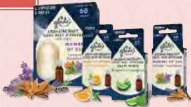
GLADE AROMATHERAPY COOL MIST DIFFUSER/ REFILL ASSORTED 16.8ML RM31.58 - RM83.48 RM31.90 - RM85.90