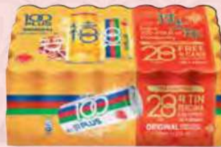
100PLUS ORI GOLD/ WHITE 325ML X 28 CNY23 RM38.88