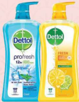
DETTOL SHOWER GEL ASSORTED 950ML RM22.30