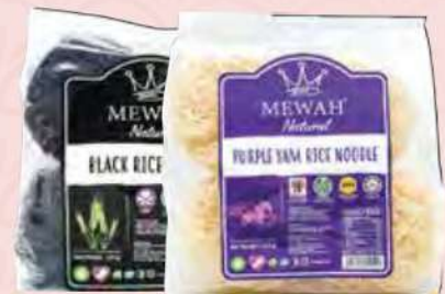
MEWAH ORGANIC NATURAL RICE NOODLE ASSORTED 200G RM8.18