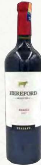
HEREFORD RESERVA MALBEC RM78.90