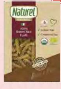
NATUREL ORGANIC 100% BROWN RICE FUSILLI 250G RM12.88