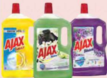
AJAX FABULOSO/ BOOST MULTI-PURPOSE CLEANER ASSORTED 1.5L - 2L RM12.88 - RM13.88 RM14.10 - RM15.00