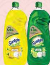
SUNLIGHT DISHWASHING LIQUID ASSORTED 900ML RM6.58 RM7.20