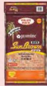
JASMINE SUNBROWN ORIGINAL 5KG RM16.68