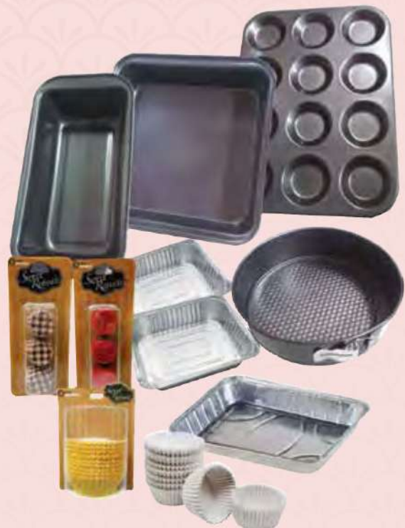
LITTLE HOMES BAKING TOOLS ASSORTED RM4.38 - RM45.18