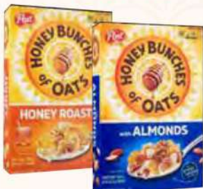
POST HONEY BUNCHES OF OATS ASSORTED 312G - 340G RM18.48