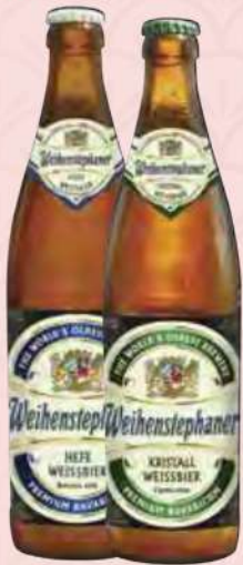
WEIHENSTEPHANER HEFEWEISSBIER/ DUNKEL KRISTALLWEISSBIER 500ML RM24.88