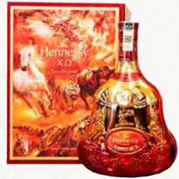
HENNESSY XO DELUXE CNY 2023 RM1,099.90