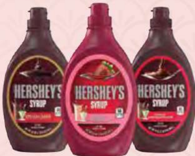
HERSHEY'S SYRUP ASSORTED 623G - 650G RM16.18