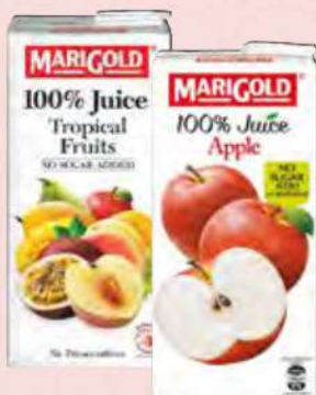
MARIGOLD 100% JUICE ASSORTED 1L RM5.78