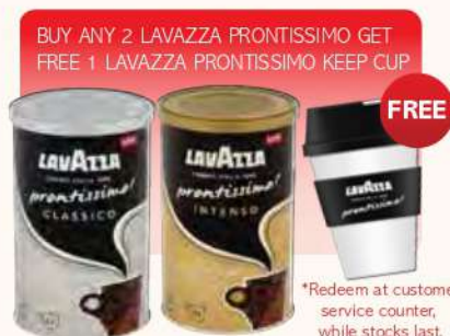
LAVAZZA PRONTISSIMO INTENSO CLASSICO INSTANT COFFEE 95G RM24.88

*Redeem at customer service counter, while stocks last.