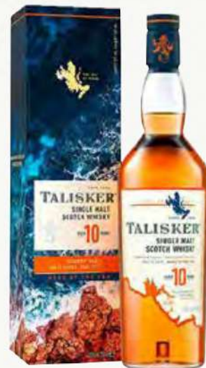
TALISKER 10 YEARS OLD RM303.90