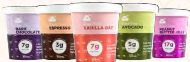
IDC SUGAR FREE ICE CREAM ASSORTED 473ML RM30.98 – RM35.58