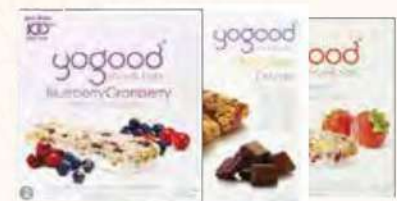
YOGOOD MUESLI/ GRANOLA BARS ASSORTED 138G RM14.38