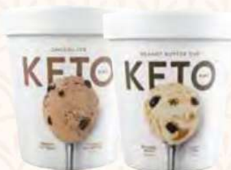
KETO ICE CREAM PINTS ASSORTED 473ML RM32.98