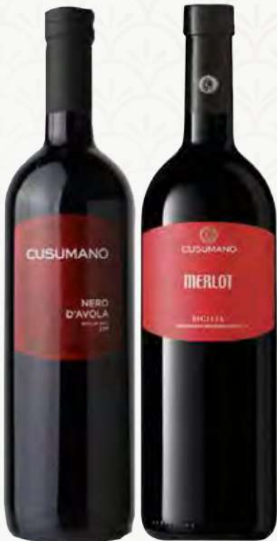
CUSUMANO MERLOT/NERO D'AVOLA Buy any 3 bottles at RM259.90 RM96.00/bottle