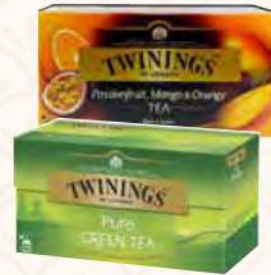
TWININGS PURE GREEN TEA/ JASMINE GREEN TEA/ GREEN TEA COLLECTION 25S X 2G - 17G RM19.18