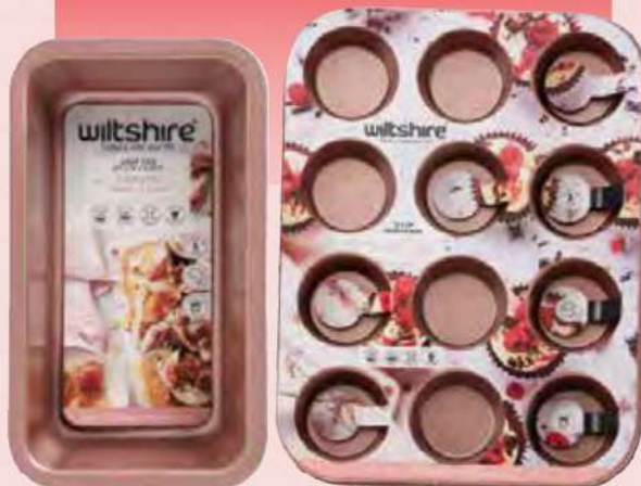
FACKELMANN WILTSHIRE ROSE GOLD BAKING TOOLS ASSORTED RM27.08 - RM39.88

AVAILABLE AT BANGSAR VILLAGE, SUNWAY GIZA, 1 MONT KIARA, CITTA MALL, DESA PARK ARKADIA, PARADIGM MALL JB, MID VALLEY SOUTHKEY & SUBANG PARADE ONLY.