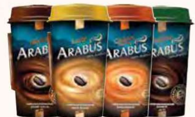
ARABUS ROASTED & GROUND ROASTED COFFEE ASSORTED 200ML RM5.48