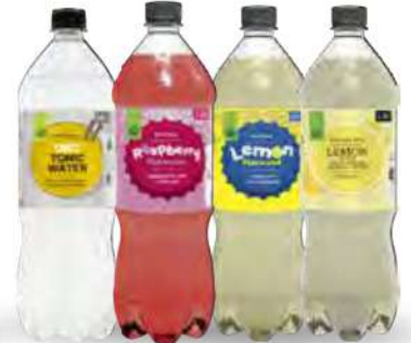
WOOLWORTHS SOFT DRINK/ SPARKLING WATER/ MIXERS ASSORTED 1.25L RM5.98