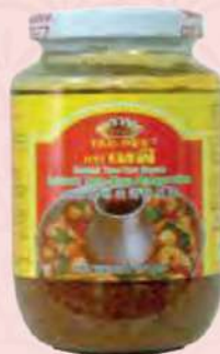
TAE PEE INSTANT TOM YUM 454G RM10.68