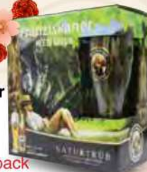
Franziskaner Hefe-Weissbier Gift Pack 5x500ml RM100.38 /pack