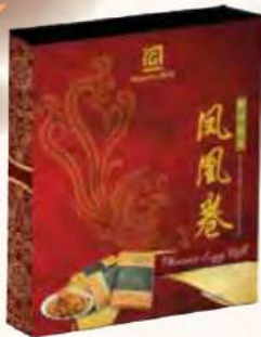
NATURE'S GOLD PHOENIX EGG ROLL WITH SEAWEED & CHICKEN FLOSS 100G RM13.98