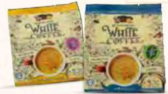
ALI MUTHU AH HOCK WHITE COFFEE RM16.58