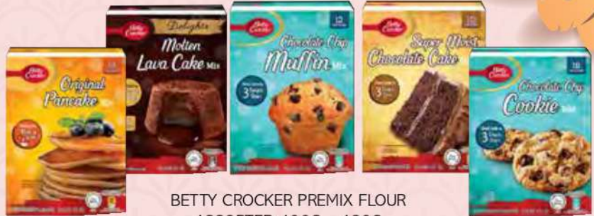
BETTY CROCKER PREMIX FLOUR ASSORTED 400G - 430G RM9.48 - RM13.28