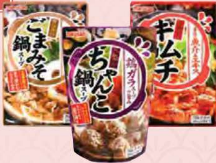
MARUSAN NABE SOUP ASSORTED 750G - 800G RM10.98