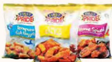
FIRST PRIDE CHICKEN/ FISH NUGGETS ASSORTED 800G RM15.58