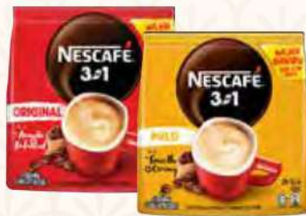
NESCAFE 3 IN 1 ASSORTED 15S - 25S X 18G - 32G RM13.88