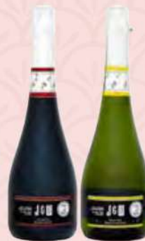
J&W SPARKLING RED/WHITE 750ML RM25.38