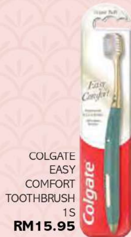
COLGATE EASY COMFORT TOOTHBRUSH 1S RM15.95