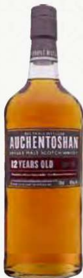
AUCHENTOSHAN 12 YEARS OLD RM327.90