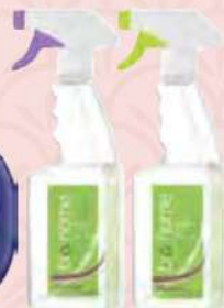
BIO-HOME KITCHEN CLEANER ASSORTED 500ML RM10.48 RM11.40