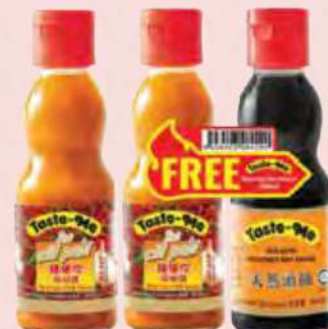
TASTE ME SOS CILI PADI VALUE PACK RM13.28