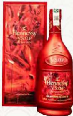
HENNESSY VSOP DELUXE CNY 2023 RM399.90