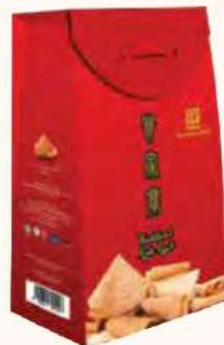
NATURE'S GOLD KUIH KAPIT GIFT BOX 100G RM13.98