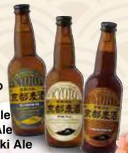
Kizakura Kyoto Beer 330ml • Kuromame Ale • White Yuzu Ale • Yamadanishiki Ale RM23.48 /bottle

All prices shown are subject to 10% service charge & 6% SST. By Participating in this promotion, you agree and confirm you are non-Muslim and above 21 years of age. The Sales of Alcohol is restricted to individual who are above 21 years old and are non-Muslim. We reserve all rights to modify or cease the promotion. Please Drink Responsibly and do not Drink & Drive.