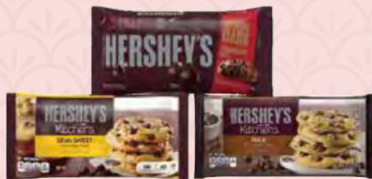
HERSHEY'S BAKING CHIPS ASSORTED 326G - 354G RM20.98