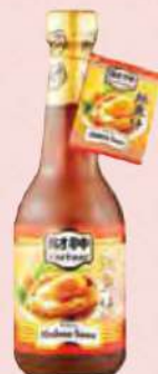
FORTUNE ABALONE SAUCE 380ML RM12.88