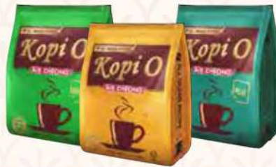
AIK CHEONG KOPI O BAG ASSORTED 12S - 20S X 10G - 18G RM7.28