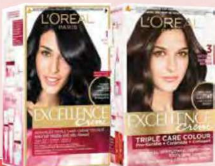
LOREAL EXCELLENCE HAIR COLOUR ASSORTED RM47.90