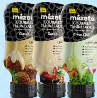
Mezete Tahini Sauce Assorted 315g RM14.29