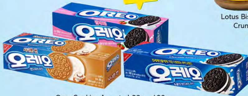
Oreo Cookies Assorted 80g - 100g RM8.49