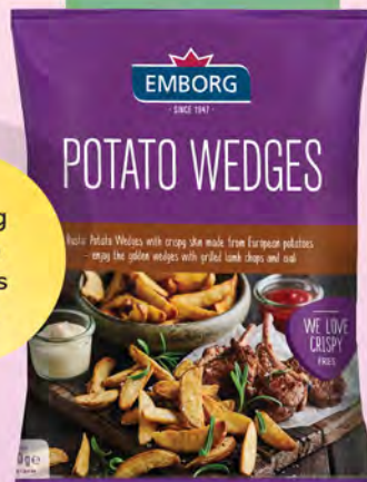
Emborg Potato Wedges 750g