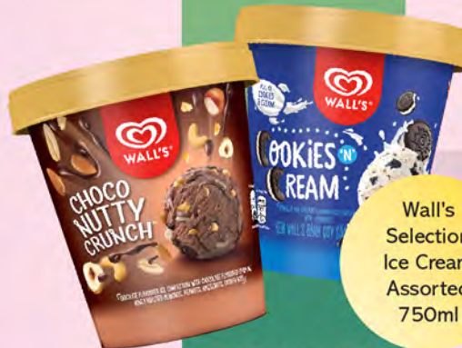
Wall's Selection Ice Cream Assorted 750ml