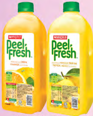
Marigold Peel Fresh Assorted 2L RM11.99