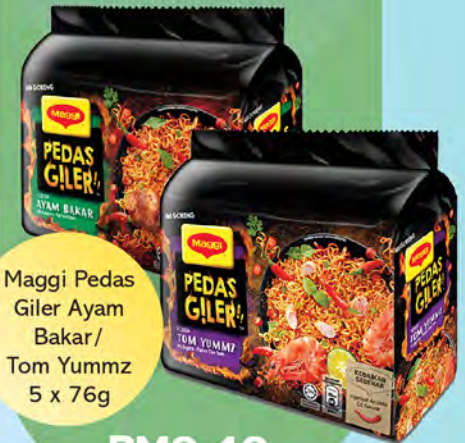
Maggi Pedas Giler Ayam Bakar/Tom Yummz 5 x 76g