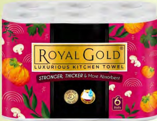
Royal Gold Luxurious Kitchen Towel 6R RM14.29