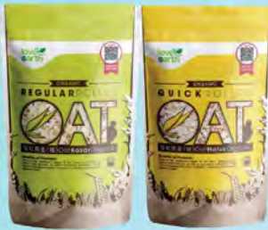
Love Earth Organic Quick Rolled Oat/Regular Oat 400g RM7.99