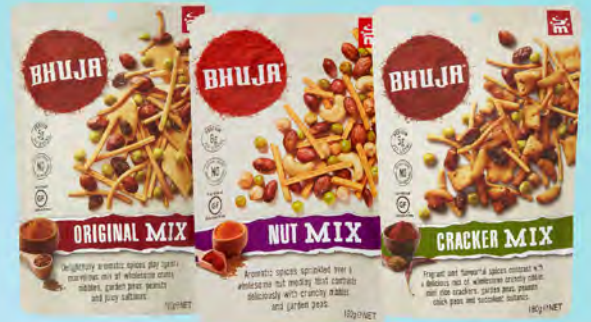
Majans Bhuja Assorted 140g - 180g RM11.49