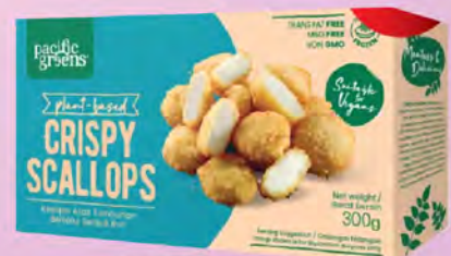
Pacific Greens Crispy Scallops 300g RM17.59