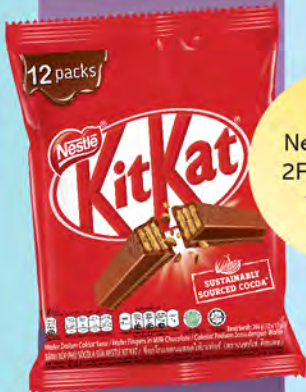
Nestle KitKat 2F Share Bag 12 x 17g