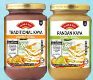
Dollee Traditional/ Pandan Kaya 330g RM9.99