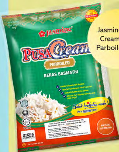
Jasmine Pusa Cream Sella Parboiled 5kg