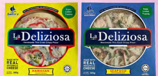
Sailor's La Deliziosa Pizza Assorted 380g RM16.99 - RM17.99