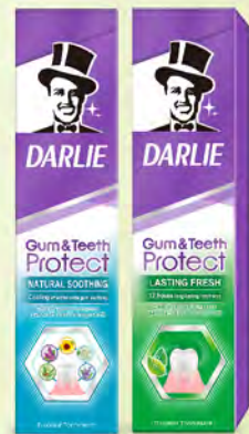
Darlie Gum & Teeth Protect Toothpaste Assorted 140g RM12.99