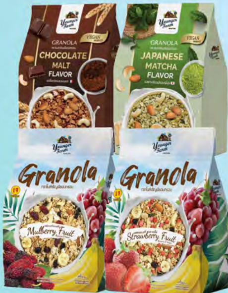
Younger Farm Granola Assorted 200g - 225g RM13.99