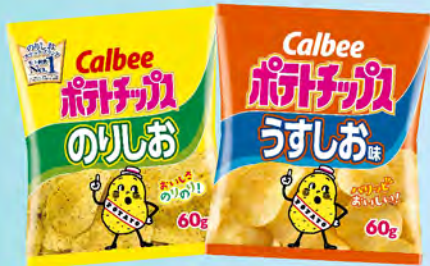
Calbee Potato Chips Assorted 60g RM7.79 - RM8.19