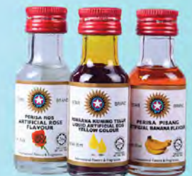
Star Food Colour/Flavour Assorted 25ml RM2.89