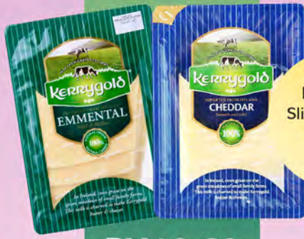
Kerrygold Sliced Cheese Assorted 150g