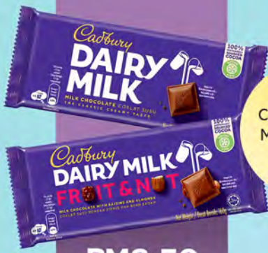
Cadbury Dairy Milk Assorted 160g