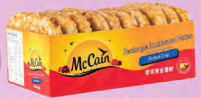
McCain Hashbrown 650g RM15.39