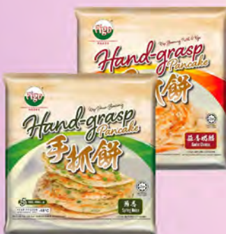
Figo Hand-Grasp Pancake Onion 600g RM10.99