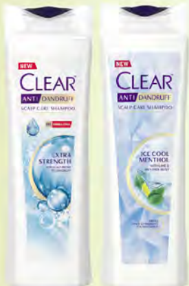
Clear/Clear Men Shampoo Assorted 300ml - 315ml RM14.99