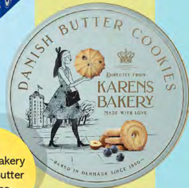
Karen's Bakery Danish Butter Cookies 454g RM23.99