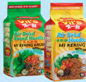
Vit's Air Dried Broad/Slim Noodles 400g RM4.49