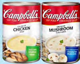
Campbell's Cream Soup Assorted 420g RM6.89