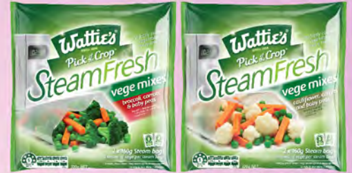
Wattie's Steam Fresh Vegetables Assorted 2 x 160g RM14.79