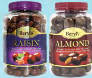
Beryl's Chocolate Assorted 370g - 450g RM23.59