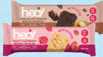
Heal Chocolate Crunch/Fruity Raspberry Breakfast Protein Bar 36g - 38g RM6.59