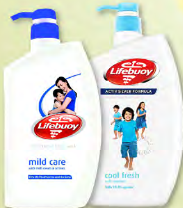
Lifebuoy Bodywash Assorted 900ml - 950ml RM18.69