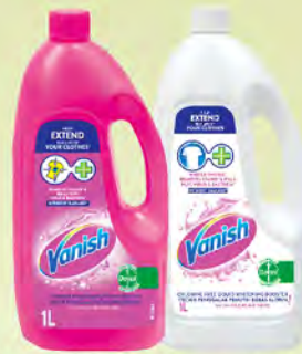
Vanish Liquid Assorted 1L RM20.99