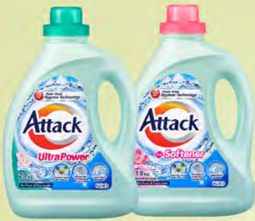
Attack Liquid Detergent Assorted 1.8kg - 2kg RM16.49