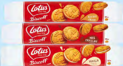
Biscoff Sandwich Assorted 150g RM7.29