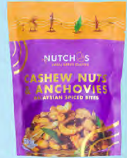
Mynutchos Spiced Cashew Nuts & Anchovies 100g RM17.89