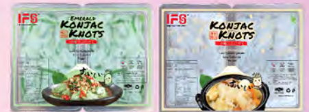
IFS Emerald/ Regular Konjac Knot 200g RM5.99