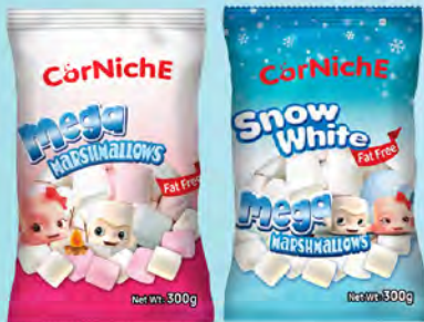
Corniches Mega/Snow White Marshmallow 300g RM10.89