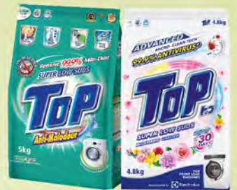
Top Low Suds Powder Detergent Assorted 4.8kg - 5kg RM38.99