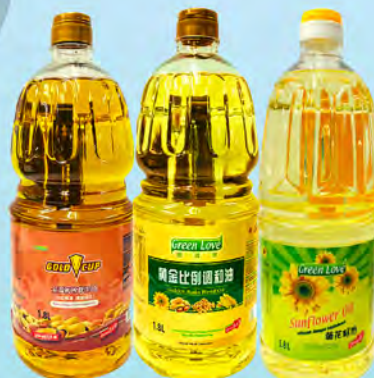
Greenlove Sunflower/Golden Ratio Blend/Gold Cup Extra Virgin Groundnut Oil 1.8L RM27.59 - RM37.99