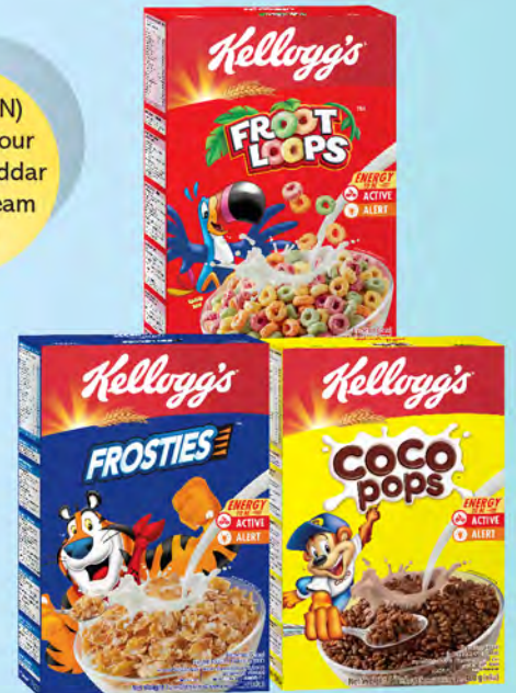
Kellogg's Cereals Assorted 285g - 350g RM12.69