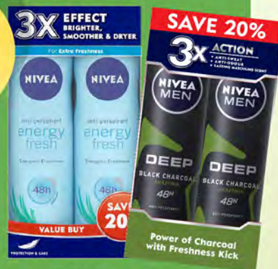
Nivea Deodorant Assorted 2 x 150ml