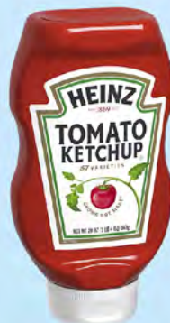
Heinz Tomato Ketchup Easy Squeeze 20oz RM14.59