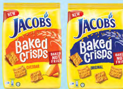
Jacob's Baked Crisps Assorted 229g RM9.19