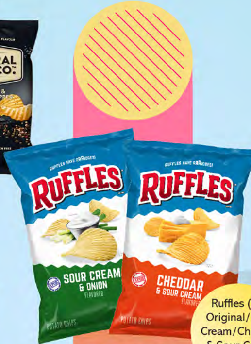
Ruffles (CN) Original/Sour Cream/Cheddar & Sour Cream 170g