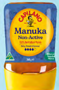
Capilano Manuka Honey Upside Down 340g RM24.69