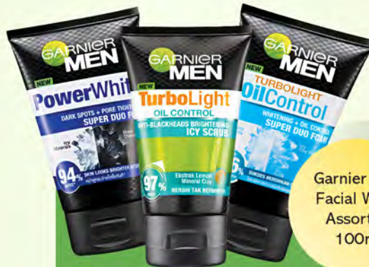
Garnier Men Facial Wash Assorted 100ml