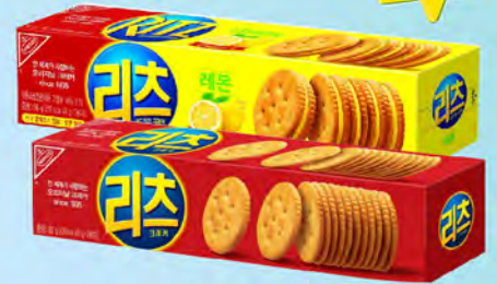
Ritz Cracker Assorted 77g - 96g RM8.49 - RM9.49