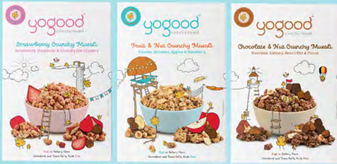
Yogood Muesli Assorted 320g RM15.29