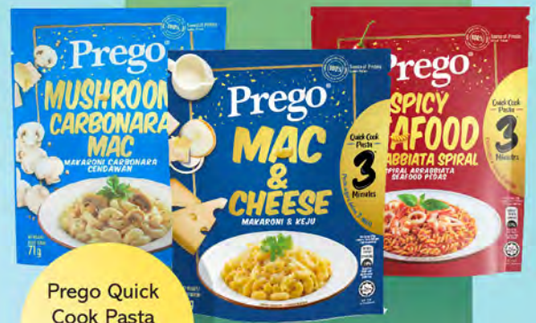
Prego Quick Cook Pasta Assorted 70g - 71g