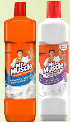
Mr Muscle Bathroom Cleaner Assorted 900ml RM10.79 - RM12.49