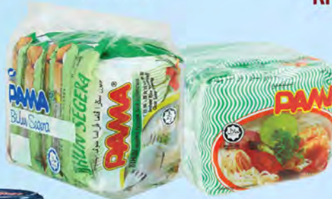
Pama Noodles Assorted 5 x 40g - 55g RM7.49 - RM8.89