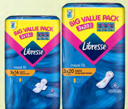
Libresse Maxi Non Wing/ Maxi Wing/ Night Extra Long Wing 3 x 12s - 20s RM17.99