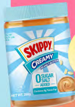
Skippy Peanut Butter No Sugar Added 280g