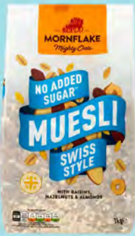
Mornflake Classic Muesli Swiss Style No-Added-Sugar 1kg RM27.49