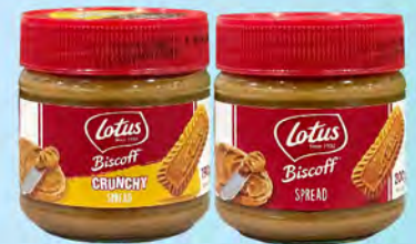
Lotus Biscoff Spread Smooth/ Crunchy 190g - 200g RM13.99