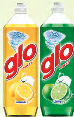
GLO Dishwashing Liquid Assorted 800ml RM5.59