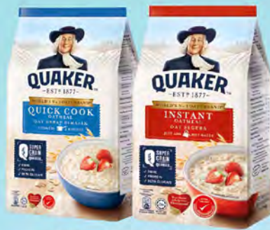
Quaker Instant/Quick Cook Oatmeal 1.2kg RM14.39