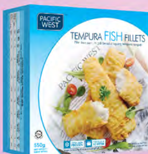
Pacific West Tempura Fish Fillet 550g RM29.29