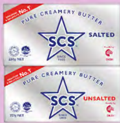
SCS Salted Butter 227g/ Unsalted Butter 225g RM14.29