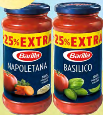
Barilla Sauce Extra 25% - Basilico/Napoletana