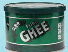
QBB Pure Ghee 400g RM33.99