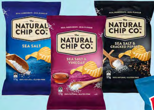
Natural Chip Co Potato Chips Assorted 175g RM13.79