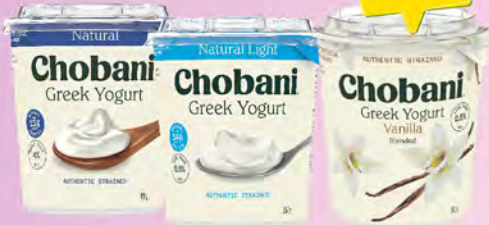
Chobani Greek Yoghurt 0% - 4% Fat Assorted 907g RM37.19