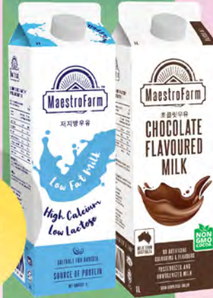
Maestro Farm Chocolate/ Low Fat Milk 1L