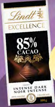
Lindt Excellence Chocolate Bar Assorted 100g