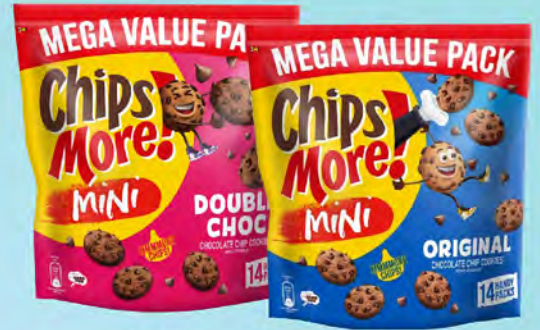
Chipsmore Double Choc/ Original Mega Value Pack 14 x 28g RM11.19