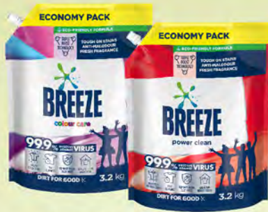
Breeze Liquid Detergent Assorted 3.2kg RM18.99