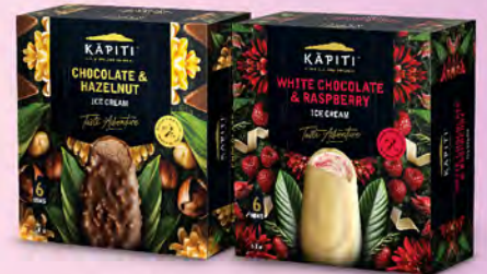
Kapiti Minis Ice Cream Sticks Assorted 6 x 60ml RM36.39